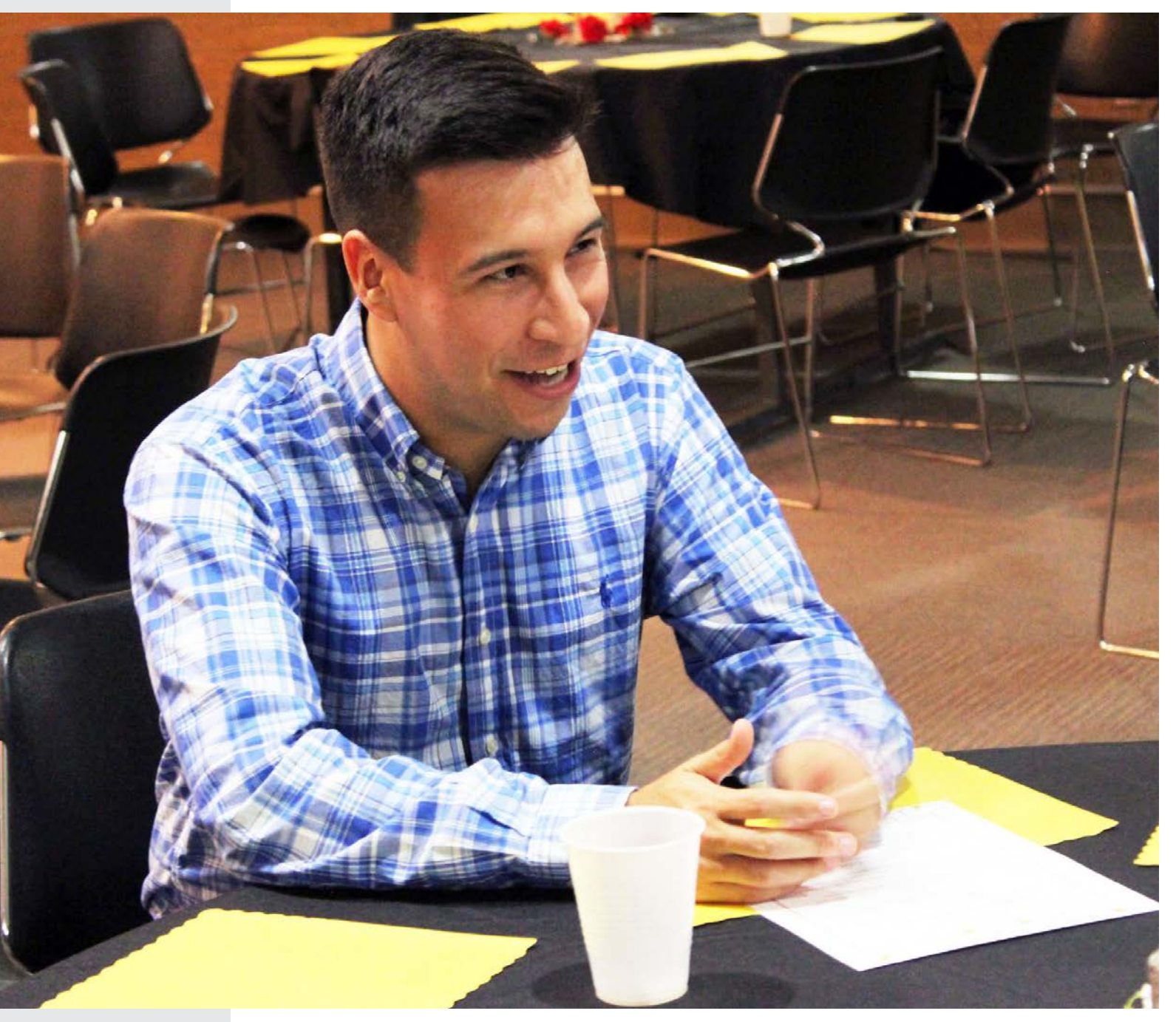
Association of Latino Professionals For America Event, Oct. 22, 2019