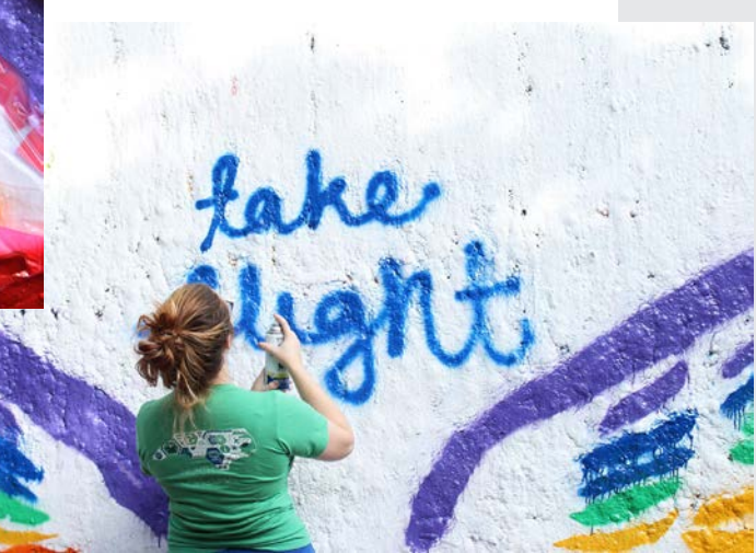
GLBT History Month, October 2019