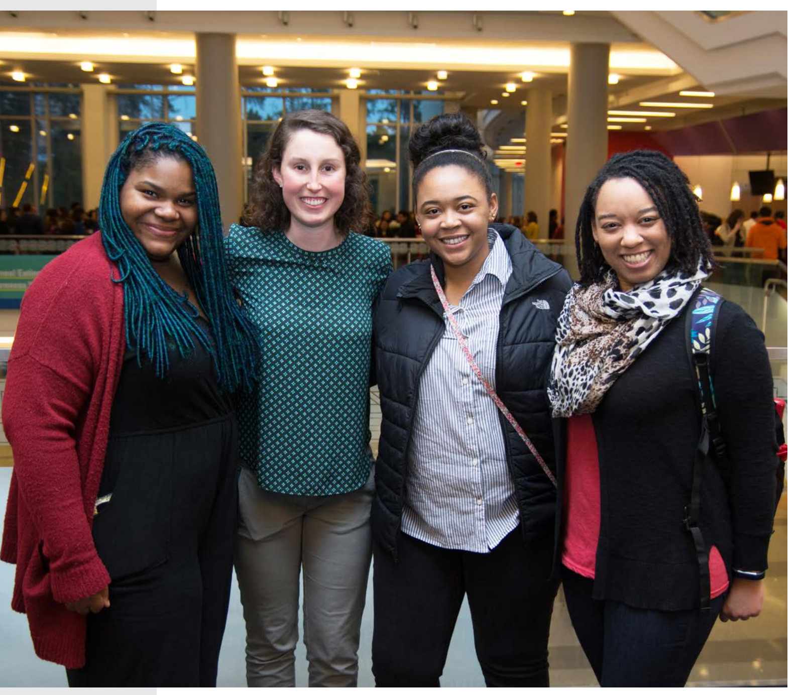
NC State University's Annual Sisterhood Dinner, Feb. 24, 2020