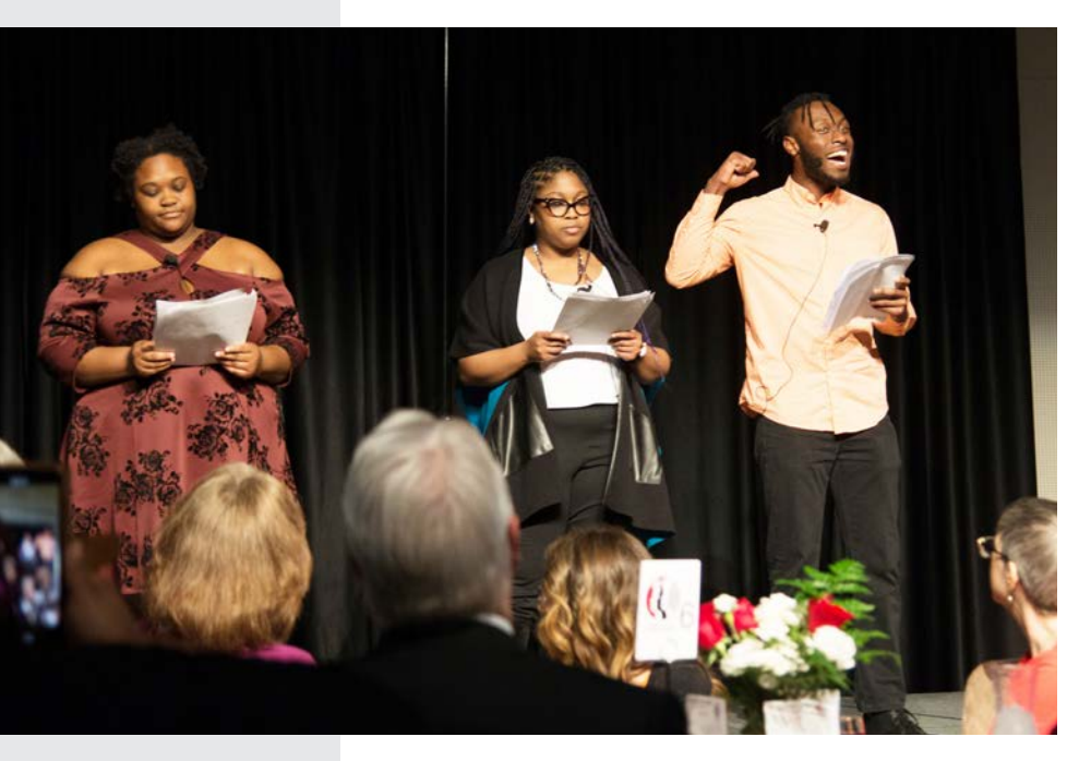
Sisterhood Dinner, Feb. 24, 2020

Due to COVID-19, we recognized our students virtually this year. In place of Lavender Graduation, the GLBT Center created a virtual yearbook. Multicultural Student Affairs also created a virtual yearbook in place of Multicultural Graduation. We look forward to resuming in-person celebrations in the future.